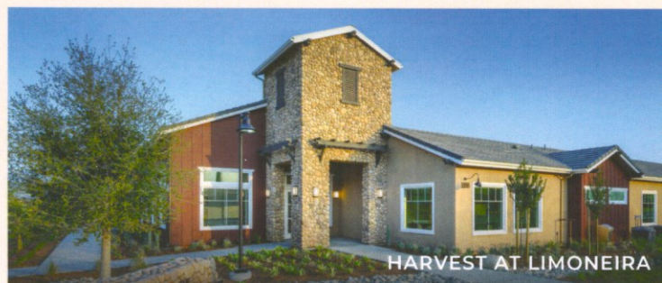
HARVEST AT LIMONEIRA