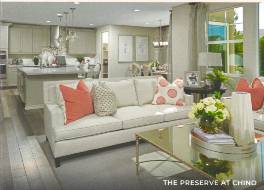
THE PRESERVE AT CHINO